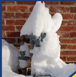
METER WITHOUT SNOW SHELTER

For more information about natural gas safety, visit www.swgas.com/safety or call 877-860-6020.