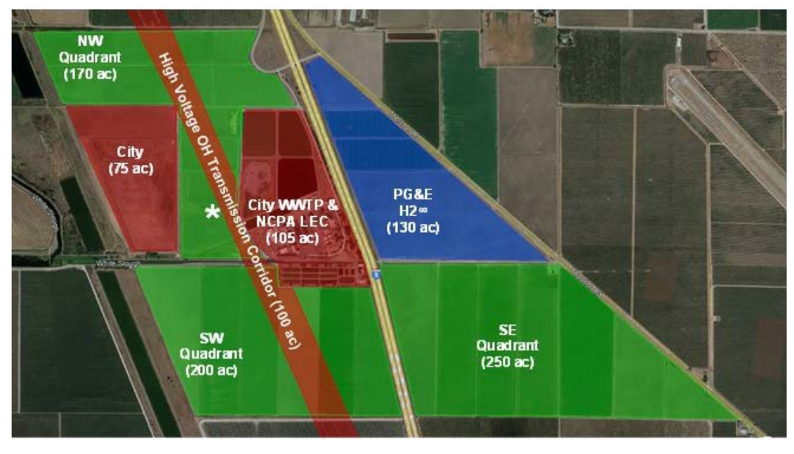
Figure 2 Aerial view of proposed Project site