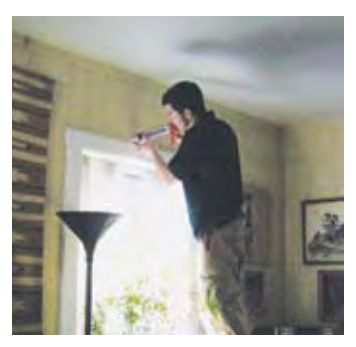
• Air leaks around windows can easily be remedied with caulk, weather stripping or low-expansion foam.

that many home electronics, even when turned off, still draw power — as much as 40 percent? Plug home audio and video equipment into a power strip, then turn the strip off when not in use.